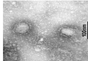
* 2003 Sars Coronavirus, Em

In 2003, following the outbreak of severe acute respiratory syndrome (SARS) in Asia, with secondary cases elsewhere in the world, the World Health Organization (WHO) issued a press release stating that a novel coronavirus identified by a number of laboratories was the causative agent for SARS. The virus was officially named the SARS coronavirus (SARS-CoV). Over 8,000 people were infected, and about 10% died.